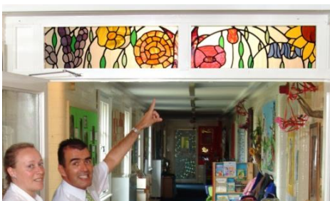
Ashburton Primary School