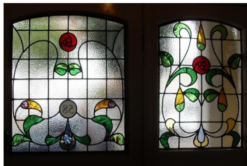
After – Residential House

I wanted to take my hobby further; therefore I took a year off French teaching and joined a full time course at college to get a diploma in Designing and Making Stained Glass. I went back to teaching, as it is more lucrative and regular than Art making, but I started taking commissions. I have now installed Stained Glass panels in schools but mainly in my friends and neighbours’ front doors, working through word of mouth.