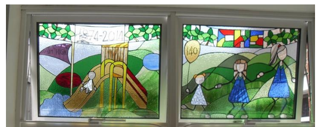
Croydon High Junior School